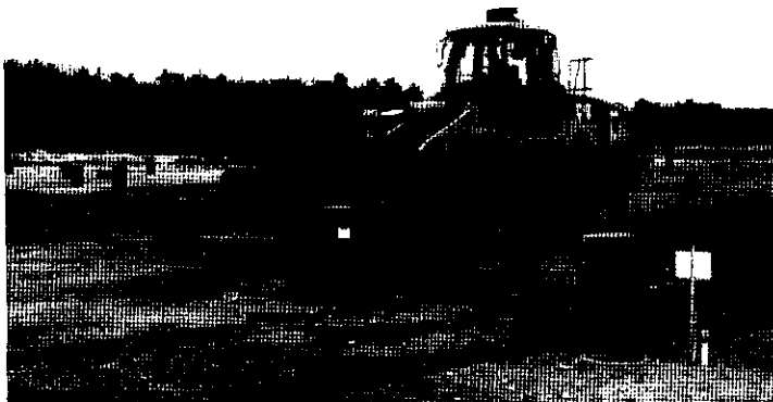
A contestant at the Road-E-O maneuvers a front end loader around the equipment course.